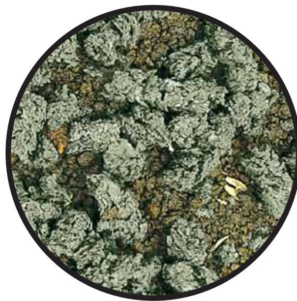
Water the Area