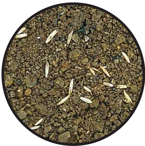
Spread the Seed