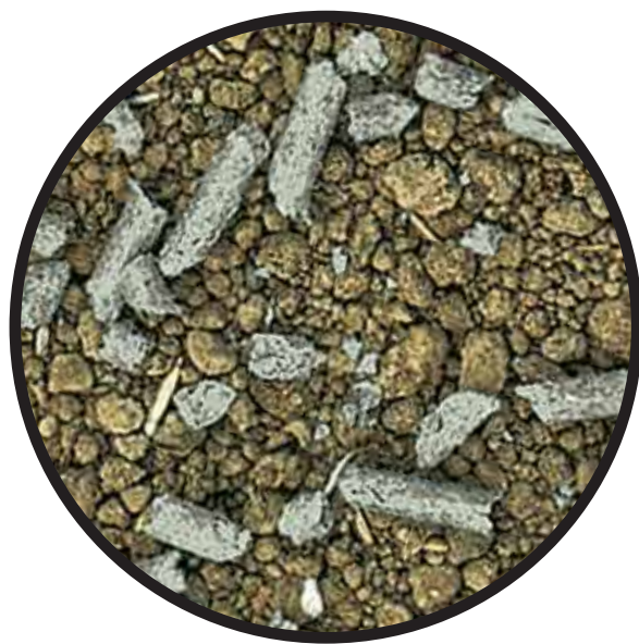
Apply the PennMulch