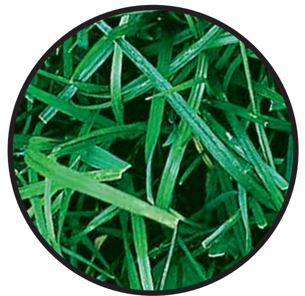
Watch it Grow